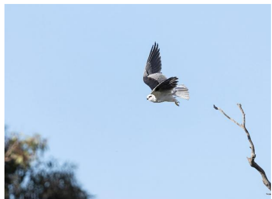
Above: black shouldered kite, Mooloort Plains, 19 April 2026, pic Geoff Park, Natural Newstead

You can listen back to sermons online at https://soundcloud.com/uca-castlemaine/tracks and https://castlemaine.ucavictas.org.au/news/