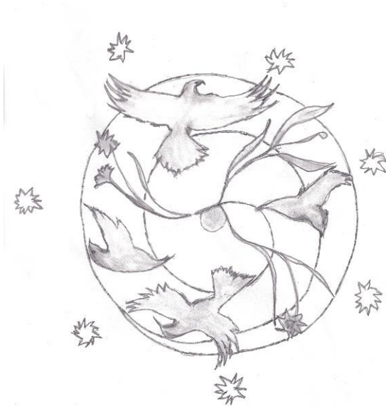
Illustration by Simon Biggs

Sat: Yandoit Sacred , Yandoit Bush Church, 2.30pm