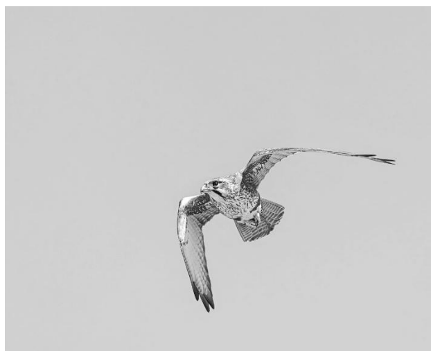
Above: Brown falcon, Yandoit, 18 April 2025.

If you want to catch up on a sermon you missed (or would like to hear again), they're online at https://soundcloud.com/uca-castlemaine/tracks and https://castlemaine.ucavictas.org.au/news/