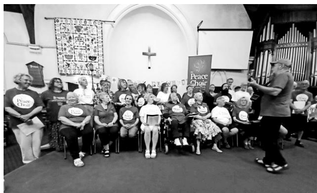
Above: Peace Choir performed at Peaceful Night, at Castlemaine Uniting Church on Wed 4 Dec.